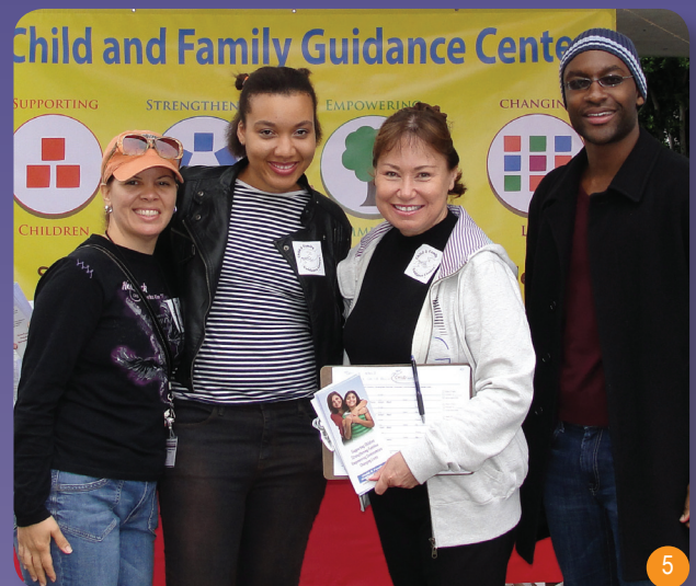
1-5 Sherman Oaks Street Fair, Oct 2010